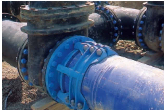
AquaGrip flange adaptor connection to a valve