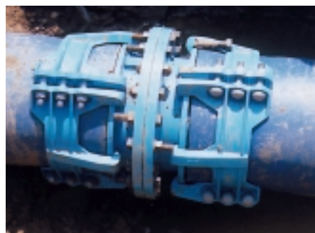
Back to back adaptors for straight line connections