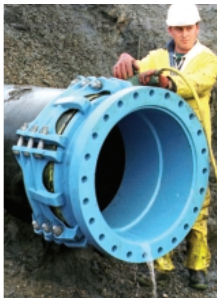
AquaGrips were used on a pumped sewerage rising main in a tidal zone near Bangor, Wales.

For non-structural lining ask for details of Viking Johnson LinerGrip, designed to offer a flanged termination to PE lined metal pipe.